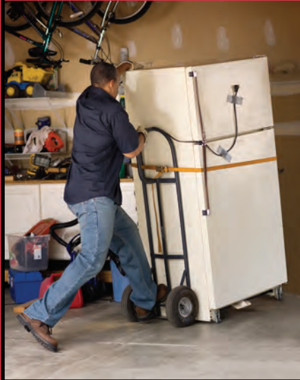
The Power of Human Connections